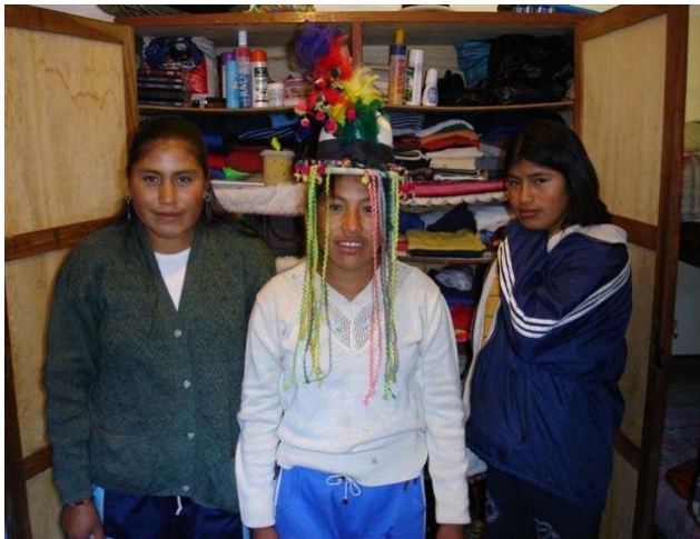
The only female students enrolled in the school, Tinquipaya Bolivia. A real cultural breakthrough.

Thank You: The Lord is so faithful Thank you to the donors who have responded since our last newsletter. We pray you can get a glimpse of the difference you are making.