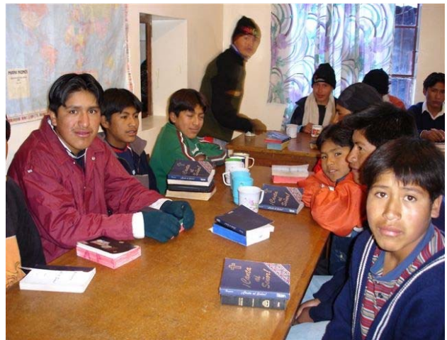
Students, Tinquipaya Bolivia