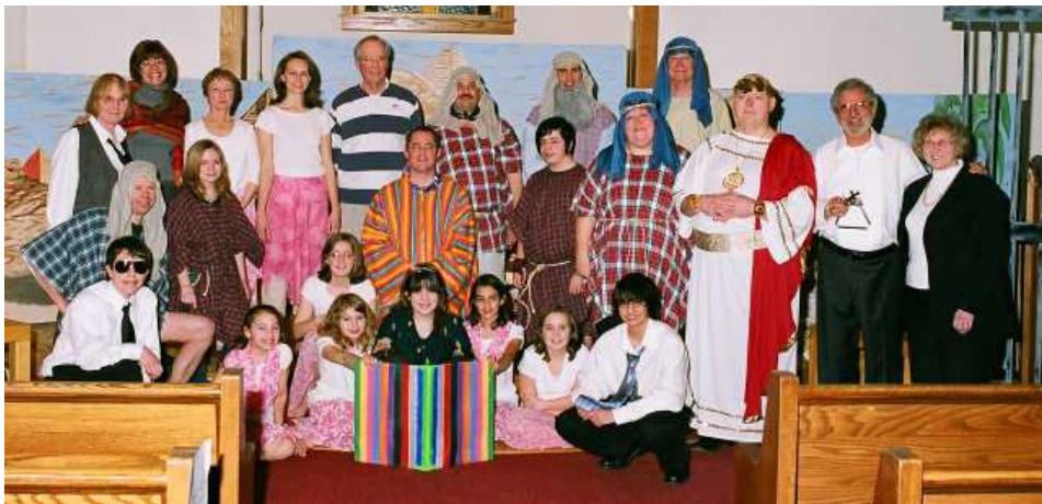
The cast and crew from Joseph and The Amazing Technicolor Dreamcoat.