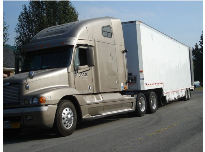
The moving truck from JAARS arrives in Tennessee

Our new telephone number is: (704) 243-7576