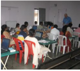
National Translators Learning about Translation Editor