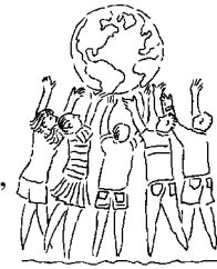
Youth Mission Project