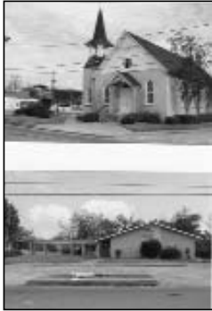
Christ Lutheran Church and Parish Hall, sign board and gutted kitchen, Pascagoula MS